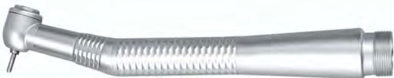
DQ.2425.02 2-holes Borden DQ.2425.04 4-holes Midwest Standard Head