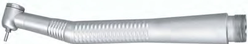
DQ.2475.02 2-holes Borden DQ.2475.04 4-holes Midwest Standard Head