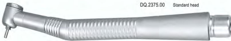
DQ.2375.00 Standard head