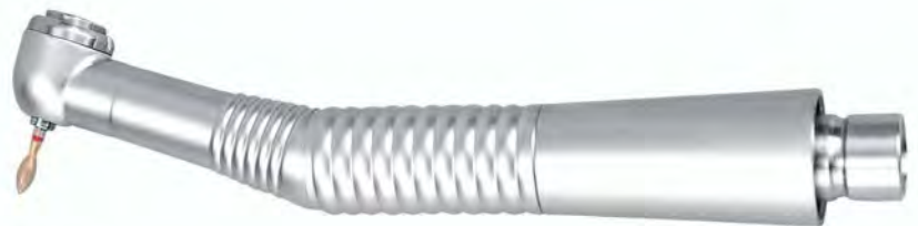
DQ.2200.00 Mini head