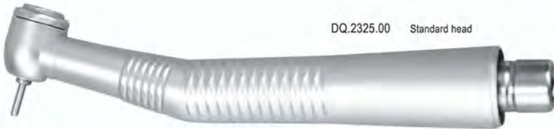
DQ.2325.00 Standard head